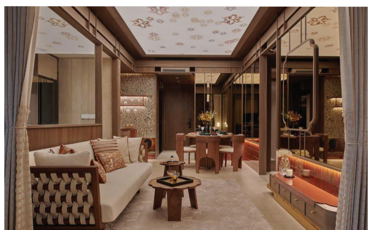
Showflat of the living area for a three-bedroom-plus-study unit