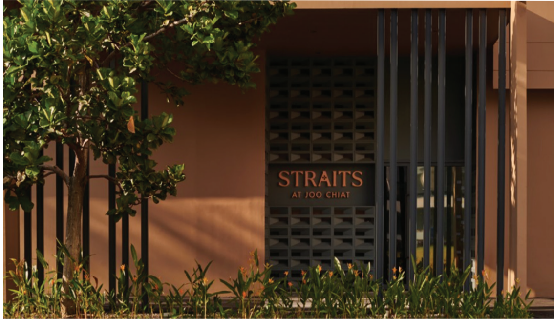
Straits at Joo Chiat is a freehold boutique development in District 15 which held its public preview on May 4

Understated nods to the Peranakan culture differentiate Straits at Joo Chiat from other developments. Unique Peranakan-inspired feature tiles can be found in the bathroom and kitchen of each unit, as well as the common areas. The wardrobe door handles for each bedroom are also specially designed to resemble a Peranakan motif.